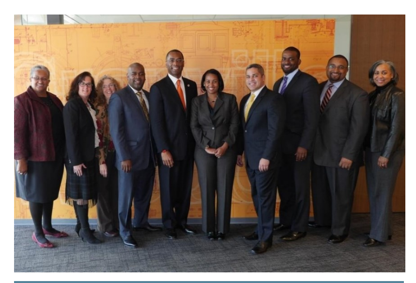
The Newark Funders Group held a forum with four of Newark's mayoral candidates at Panasonic's North American headquarters in Newark, New Jersey.

inauguration, grantmakers convened several times to craft strategies to engage and support the administration. Drawing inspiration from the retreats held in New York City prior to Mayor Bill DiBlasio's election, Newark grantmakers supported Mayor-Elect Baraka by offering to underwrite cross-sector convenings that addressed the Mayor's priorities. The resulting meetings, which included philanthropic leaders, as well as government, nonprofit, education and business stakeholders, culminated in the creation of the Newark Mayoral Transition Briefing . Mayor Baraka embraced the recommendations set forth in this document, and included the publication as an appendix to his official transition report: Blueprint for a New Newark .