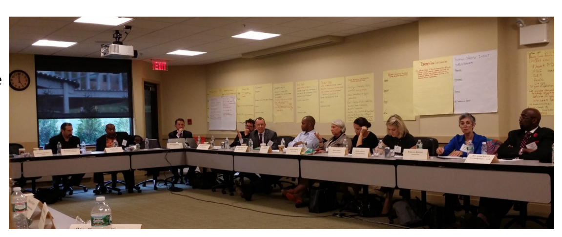
A cross-sector retreat on public safety was organized by the Liaison office with the Mayor's Office, Rutgers University-Newark, and regional grantmakers. A "Safer Newark Council" is poised to emerge from the convening.

Private initiatives have great potential to be more effective and far-reaching when they are jointly executed. The office of the Newark Philanthropic Liaison serves as a catalyst to connect funders across silos for collective impact and longterm benefits. During 2013-2014, existing collaboratives, such as the Greater Newark Funders Workforce Collaborative and the Newark Arts Education Roundtable, were joined by new collective efforts. Funders are