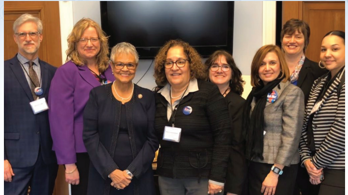
CNJG Foundations on the Hill delegates have a few minutes with Congresswoman Bonnie Watson Coleman.

While the coronavirus was just beginning to shut down Washington, we were able to connect with the majority of our representatives' offices including meeting directly with Congresswoman Watson Coleman, Congressmen Malinowski and Smith, and Senator Menendez. During our meetings we discussed our support for tax policy that encourages charitable giving, including the universal charitable deduction; philanthropy cannot fill the gaps left