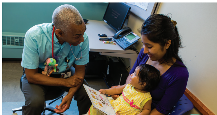
The Burke Foundation supports Reach Out and Read New Jersey, a nonprofit organization distributing books during pediatric care visits, and encouraging families to read aloud together.