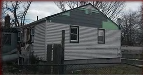
NJ Legislature passes bill of rights for Superstorm Sandy victims seeking relief